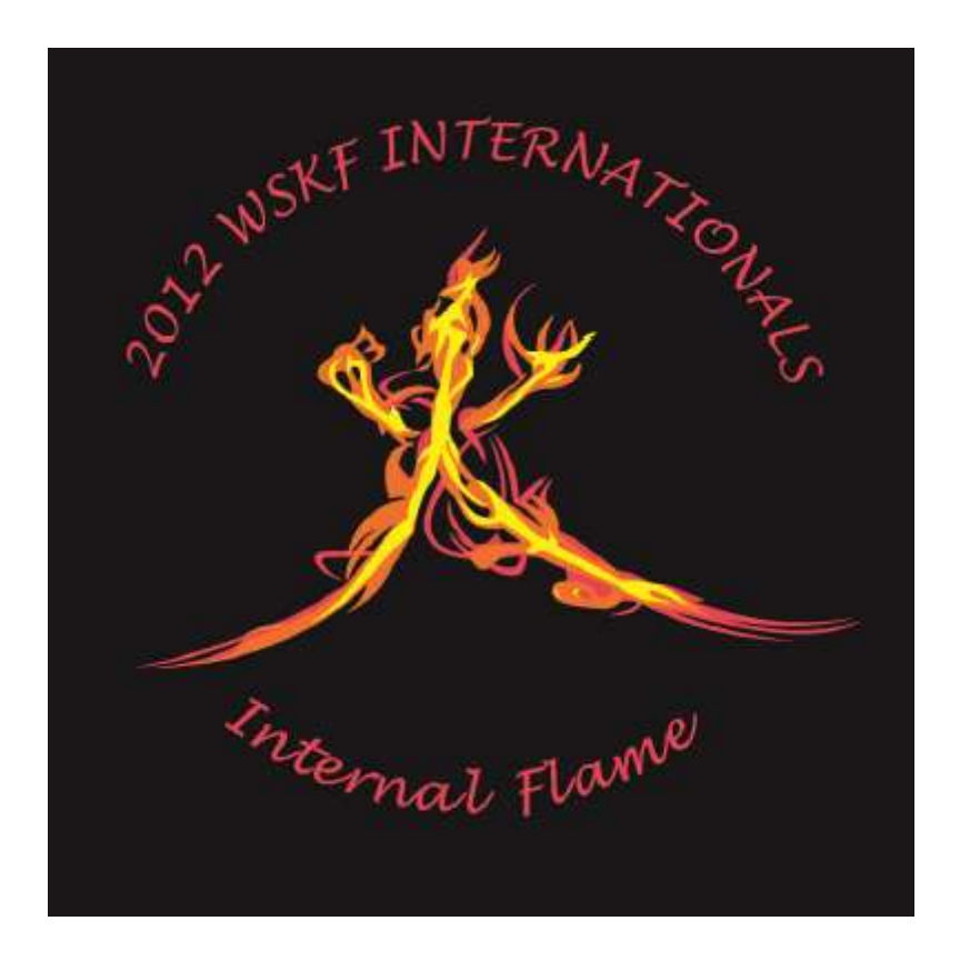
When the fire just starts, the color is red. When it gets hotter, the color changes into blue. When it reaches to the highest temperature, it has no color." – Author unknown