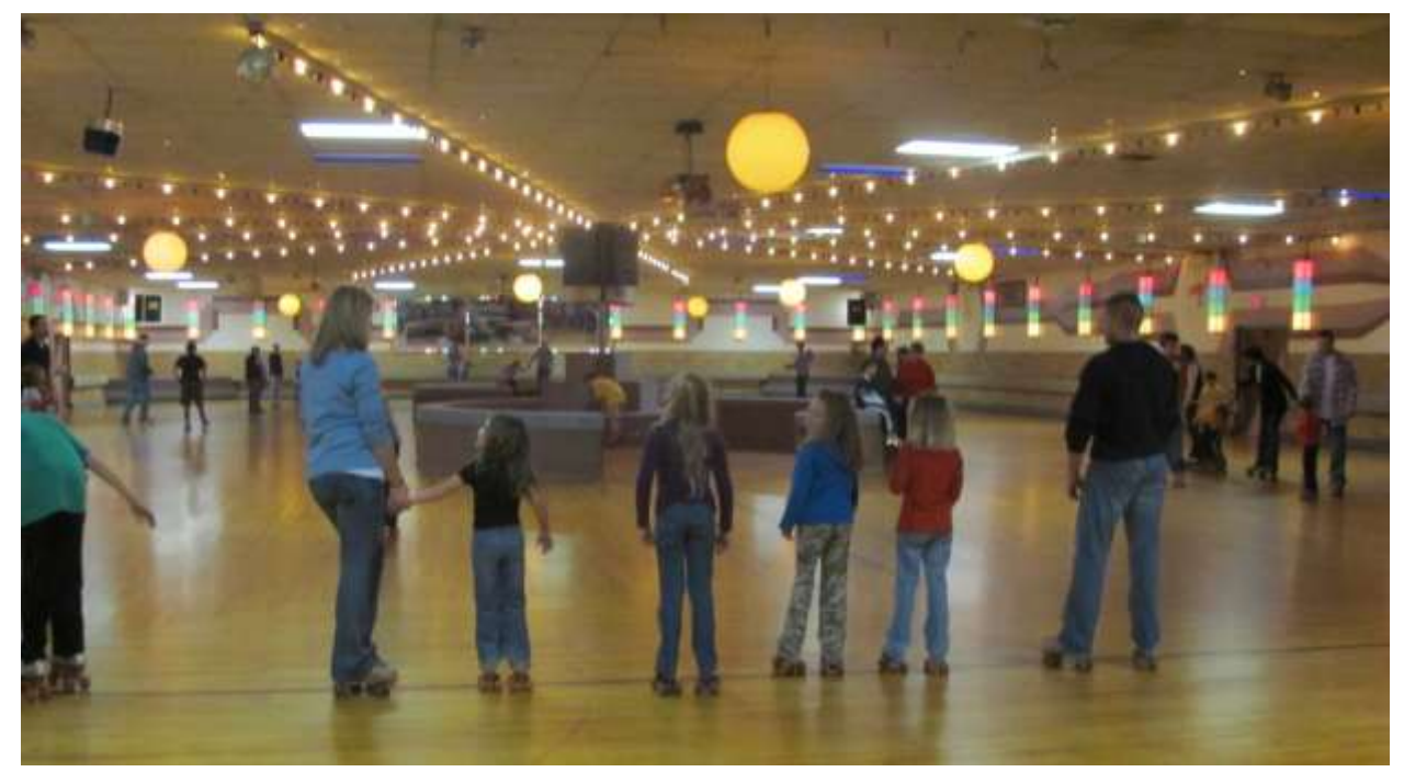
Students, parents and friends shaking to the hokey-pokey.

Students, parents and friends enjoyed the Christmas Party held at the 36 Skate Club with lots of great food and camaraderie. They had an excellent time trying to keep their balance and some students even getting to practice their proper falls. We got everyone on the floor shaking it to the hokey-pokey. Thanks for everyone attending and making this a memorable time.